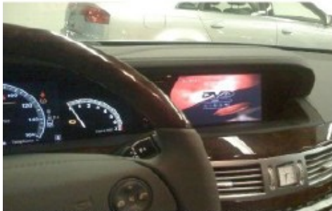
2008 S/CL Class with VIM221