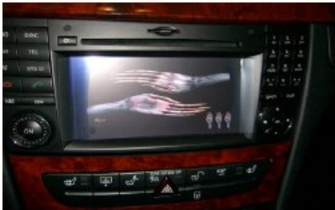
2009 E Class with VIM211 Module