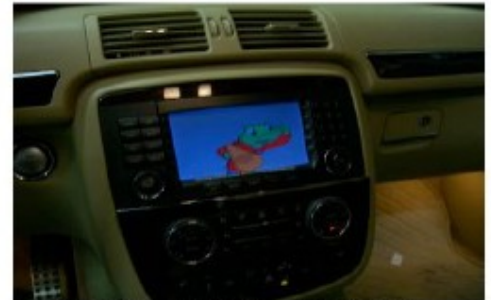
ML/GL/R Class Video using VIDM01

Video in Motion interface modules allows the DVD changer and rear seat entertainment systems to be viewed by a third occupant in the front passenger seat while the vehicle is in gear. Mercedes command systems now allow DVD videos to be played but video is disabled in gear. The VIM modules allow the video to be watched at any speed.