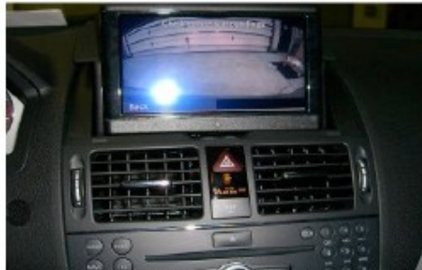
2008 C Class with VIM204