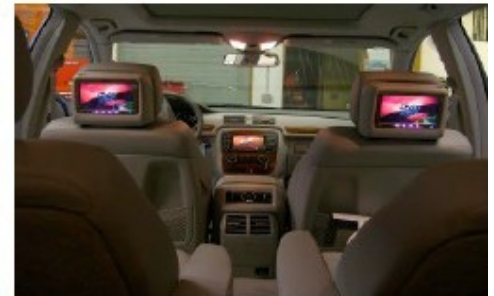
R Class Front Video using VIDM02