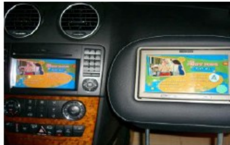
2009 ML Class with VIM164 and RSE enabled